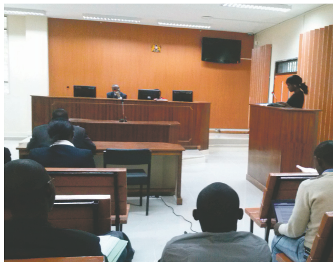
Students participating in a moot session in Parklands School of Law

The School started running its law programme in 1970, long before the requirement for accreditation by the Council of Legal Education (CLE). When the requirement for accreditation was instituted by CLE, we obtained provisional accreditation. We have since submitted documentation for full accreditation and we are awaiting visitation by the CLE. Pursuant to the repeal of the University of Nairobi Act and the enactment of the Universities' Act No. 42 of 2012, we have as part of the University of Nairobi, obtained a Charter. This was granted on 1 st March 2013 after an Institutional Quality Audit by the Commission for University Education (CUE).